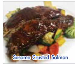
Sesame Crusted Salmon