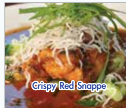
Crispy Red Snapper