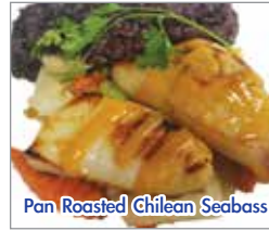
Pan Roasted Chilean Seabass