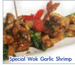
Special Wok Garlic Shrimp